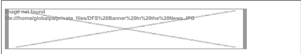
Image not found https://cdn.ofsys.com/FILES/2020/08/03/1574/C289/1257012/irx1Xu/20170109-icon-h2.png

Submitted by Victoria on August 3, 2020 - 9:17am