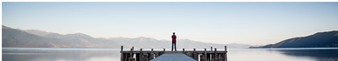
Image not found https://cdn.ofsys.com/FILES/2020/08/03/1574/C289/1257012/irx1Xu/20170109-icon-h2.png

NEW ONLINE VERSION OF THE FINANCIAL PERFORMANCE BROCHURE FOR PARTICIPATING LIFE INSURANCE